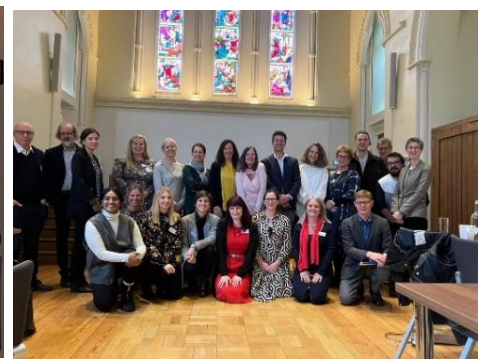
St Luke's Chapel, Oxford; Welcome slide; Conference delegates.