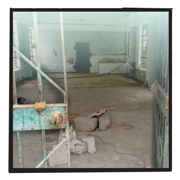
Prison in Yemen.