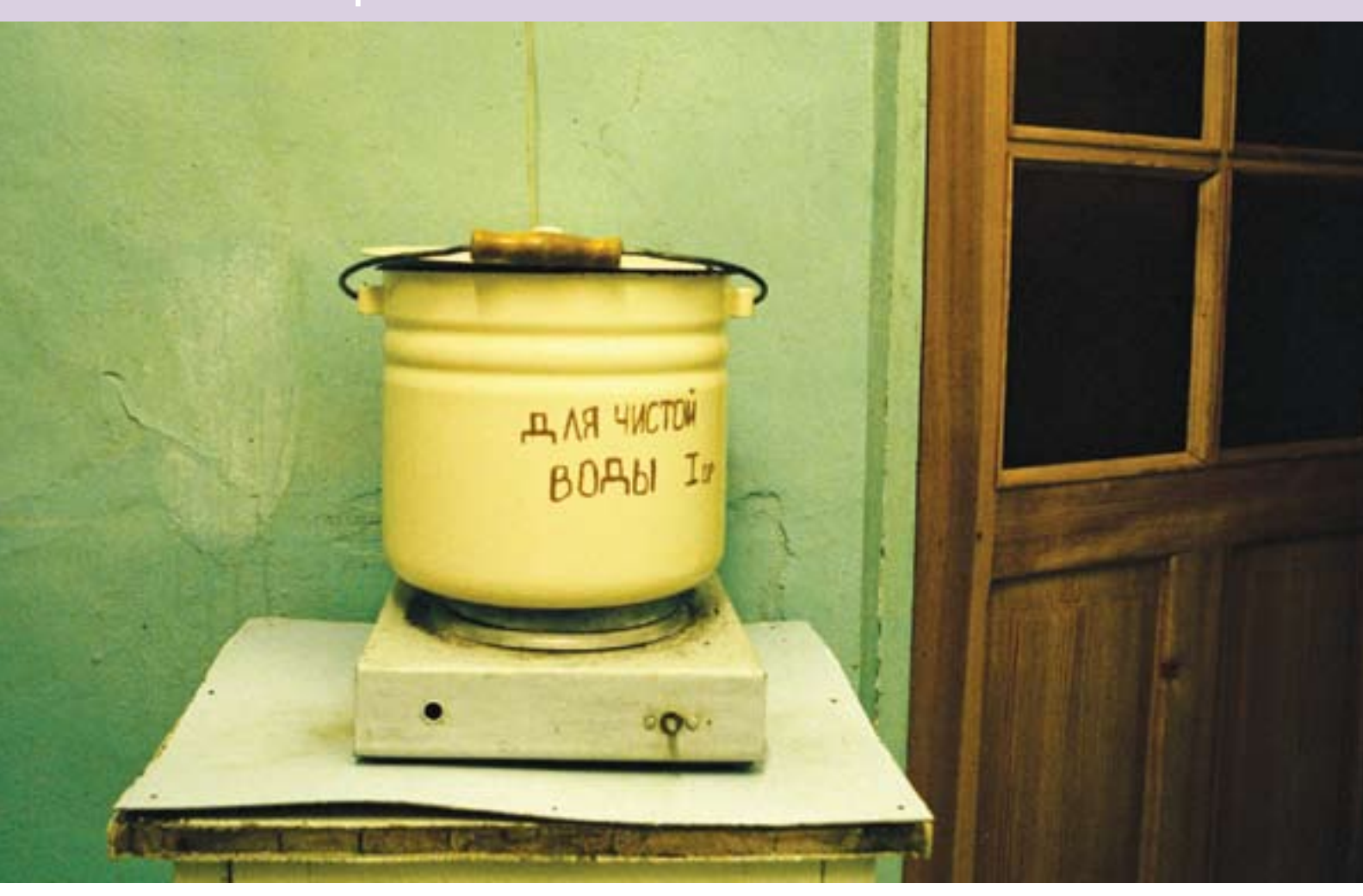
'For clean water' - Mordovia women's prison, Russian Federation