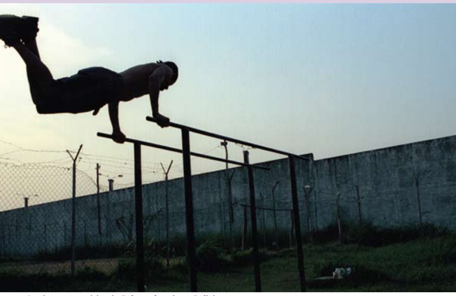
A prisoner exercising in Palmasola prison, Bolivia