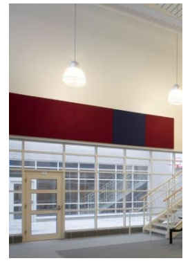
Union County Juvenile Detention Center, NJ, RicciGreene Architects Design