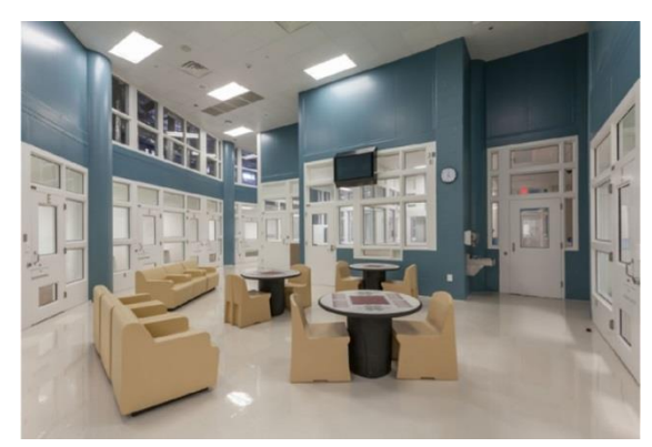
Dallas County Jail and Mental Health Medical Modernization, furnishings designed to withstand vandalism

Materials, finishes and furniture choices should provide safety for residents and staff and confer a trusting and positive environment for patients' recovery and rehabilitation. Normal materials, fixtures, and domestic furnishings appropriate to the security requirements of each population should characterize the design of the spaces housing mentally ill offenders. Solid, securely mounted or built-in furniture may be appropriate for populations where the furniture must be stationary. In units where the population has more autonomy, movable furniture provides greater flexibility.