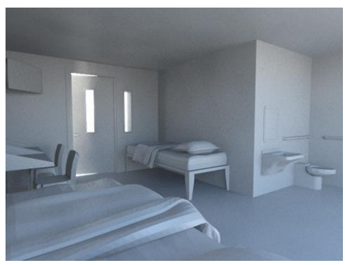
Alvin S. Glenn Detention Facility, Richland County New Mental Health Services Center – Recovery rooms interior concepts

More active environments that lift the spirits and appear friendly can also be calming. In these instances, warm more optimistic color palettes and color accents make the interiors more interesting, brighter, cheerful and personalized.