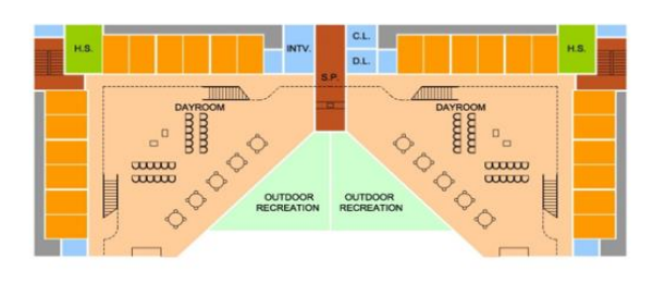
Acute Housing Unit - Single occupancy cells