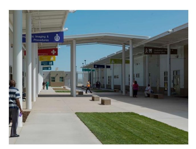
CHCF – Stockton Main Street