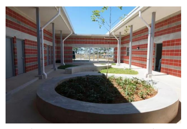
Center for Comprehensive Attention San Rafael, Costa Rica CGL Architects Design