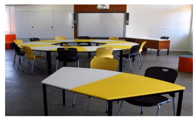
Intensive Learning Center. Mid North Coast Correctional Centre. NSW. Australia