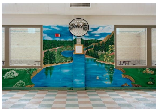
Woodbourne Correctional Facility, New York. Photo credit: Alyse Emdur from the series "Prison Landscapes"