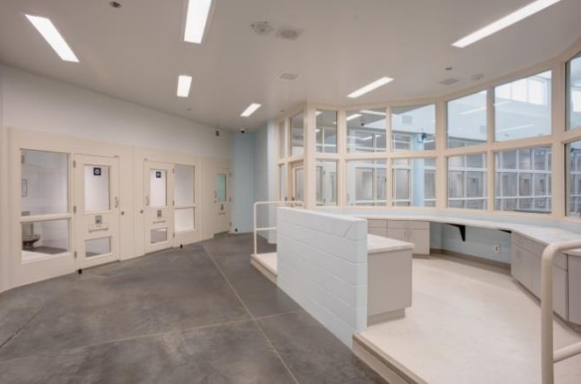
Close Watch Single Observation Cells David L. Moss Justice Center Mental Health Expansion for Tulsa County (Dewberry Architects Design)

In areas with the highest level of concern for suicide, specifications for lighting fixtures, ceiling systems, furniture, mirrors and hardware must be considered carefully to prevent self-harm. Advancements in tamper-resistant equipment, furniture, and fixtures have reduced the incidences of self-harm.