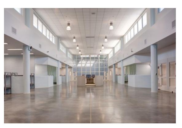
Controlled General Population, Step Four