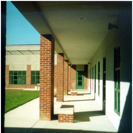
Delaware Co-ed Forensic Mental Health Facility, RicciGreene Architects Design

Connection to nature is therapeutic and can positively influence behavior. Adding aspects of nature into design is known to reduce stress and aggression<sup>2</sup>. Incorporating nature into space means introducing features like plants, small courtyard gardens, open recreation with seating areas, and the like. In situations where this is not practical or possible, placing realistic landscape art on the walls, green walls, or the use of furniture with organic shapes that evoke nature can help with stress management and emotional restoration.