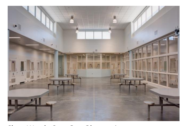
Close Watch, Step One Observation