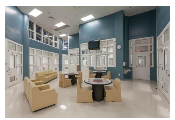
Dallas County Medical Modernization, HDR Furnishings designed to withstand vandalism

Materials, finishes and furniture choices should provide safety for residents and staff and confer a trusting and positive environment for patients' recovery and rehabilitation. Normal materials, fixtures, and domestic furnishings appropriate to the security requirements of each population should characterize the design of the spaces housing mentally ill offenders. Solid, securely mounted or built-in furniture may be appropriate for populations where the furniture must be stationary. In units where the population has more autonomy, movable furniture provides greater flexibility.