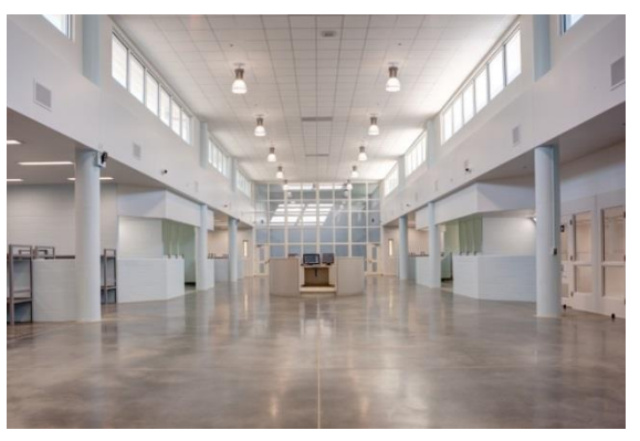
Controlled General Population, Step Four