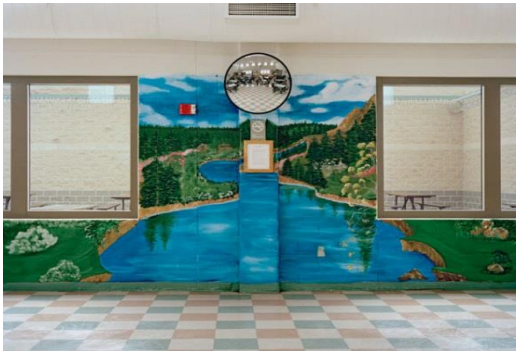
Woodbourne Correctional Facility, New York. Photo credit: Alyse Emdur from the series "Prison Landscapes"