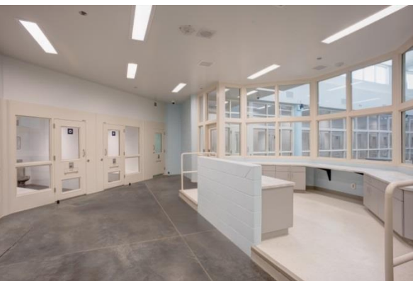
Close Watch Single Observation Cells David L. Moss Justice Center Mental Health Expansion for Tulsa County (Dewberry Architects Design)

In areas with the highest level of concern for suicide, specifications for lighting fixtures, ceiling systems, furniture, mirrors and hardware must be considered carefully to prevent self-harm. Advancements in tamper-resistant equipment, furniture, and fixtures have reduced the incidences of self-harm.