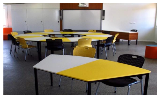
Intensive Learning Center. Mid North Coast Correctional Centre. NSW. Australia

Open planning affords better sightlines and it eliminates the anxiety and uneasiness created by crowded and cramped conditions. The design of mental health facilities should anticipate an orderly sequence of spaces that are designed to provide a secure, yet calming and safe environment. Good orientation is of particular importance when dealing with vulnerable populations. "A building layout that can be easily understood reduces stress and confusion" adds Don Thomas.