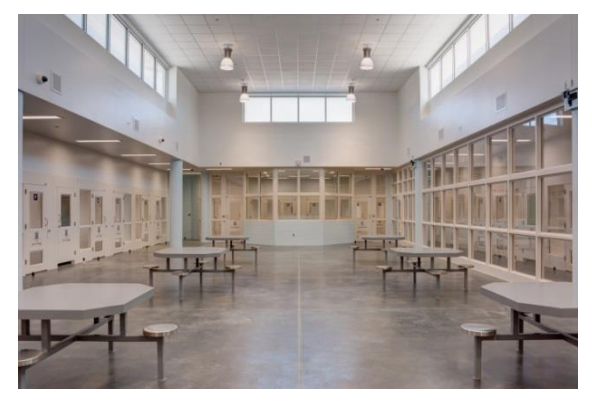
Close Watch, Step One Observation