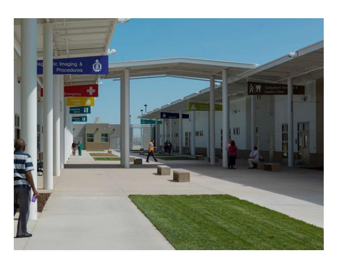
CHCF – Stockton Main Street